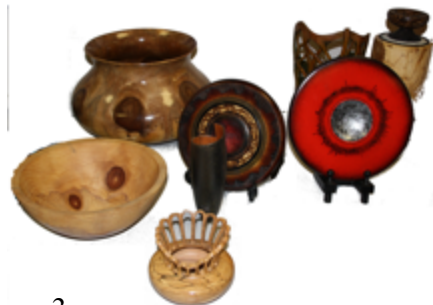
Some of Frans' work

the wood is completely dry, Frans used a Dremel rotary tool (with foot control) and carbide burrs to carve out the shapes. The cut-off top was replaced to support the piece during carving.