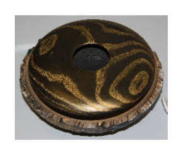
Gilt cream hollow form