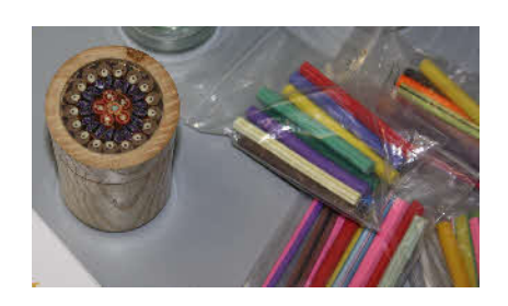
Clay topped box