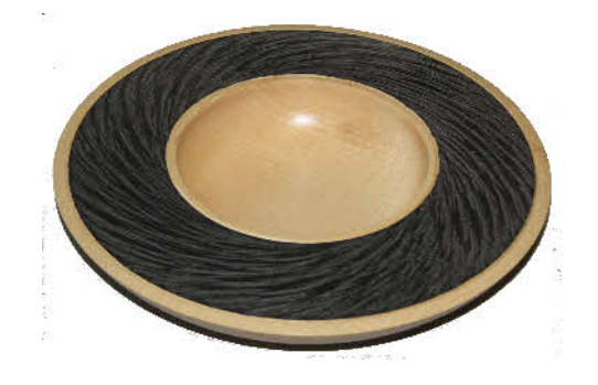
Some of Richard's work

After mounting the lid back in the chuck, Richard then used light draw cuts until the wood was exposed again. As the resin sits in V-grooves, deeper cuts will result in narrower resin lines, or a domed or concave top will result in resin lines that vary in thickness.