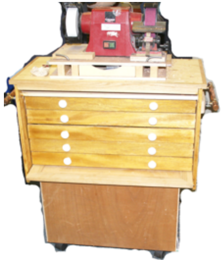
Mick's hand made mobile tool cabinet