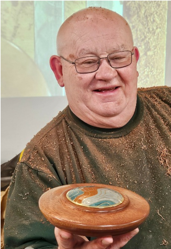
The finished bowl with coloured lacquer metallic lid fitted.